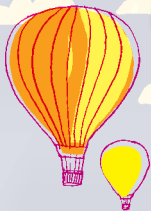
Hot air balloons